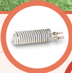
DOMESTIC HOT WATER INDUSTRIAL USE