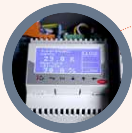
ELECTRONIC EXPANSION VALVE